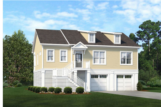
ELEVATION A (shown on cover)